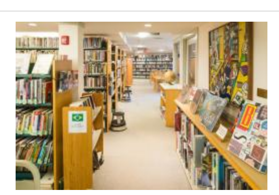
Library trustees plan to raise private funds to cover the $1 million expansion project. — Ray Ewing

The plan calls for the addition to be completed by 2020.