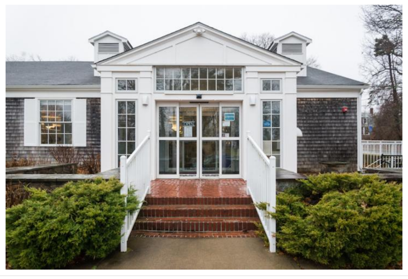
Library at 200 Main street Vineyard Haven has seen more than one expansion over the years.